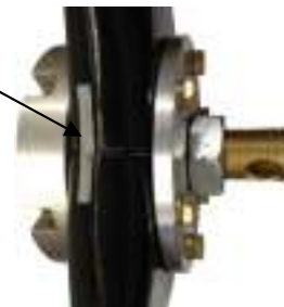
SIDE VIEW 3-BLADE QUICK ADJUSTABLE PROP