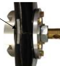
SIDE VIEW 3-BLADE QUICK ADJUSTABLE PROP